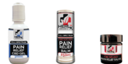
300MG Gel | 250MG Balm | 250MG Salve