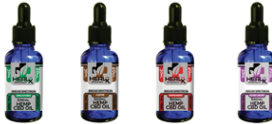
Unflavored | Coffee | Peppermint | Mixed Berry

300MG | 600MG | 1200MG 10 per serving | 20 per serving | 40 per serving