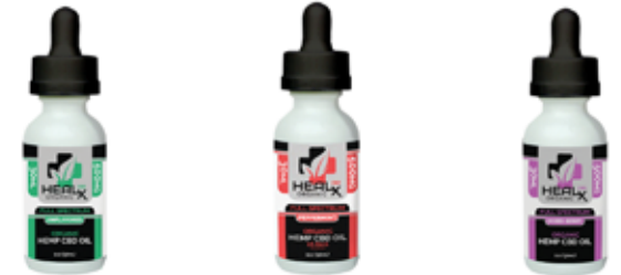
Unflavored | Peppermint | Mixed Berry

500MG | 2400MG 16.6 per serving | 80 per serving