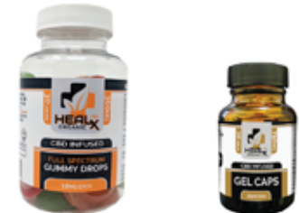
Gummy Drops | Gel Caps

360MG | 750MG 12 per serving | 25 per serving