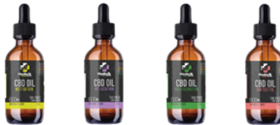
Motivation | Relaxation | Rejuvenation | Energetic

Notes of: Pine, Woody | Sweet, Floral | Lemongrass, Cherry | Citrus, Orange